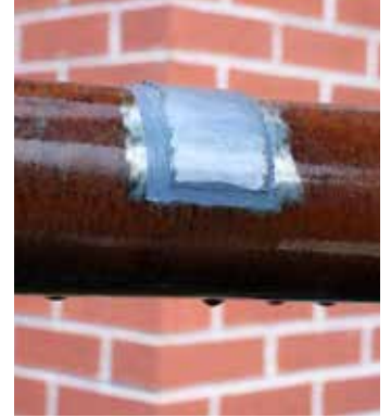
Application to wet, or oil contaminated surfaces